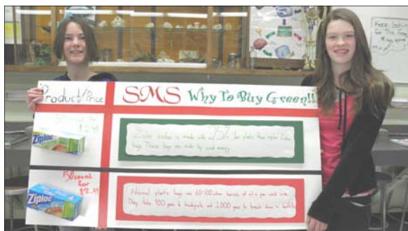
Photo: SMS students promote awareness of real-world environmental issues and propose workable solutions.

Siemens Challenge is a long-term, experiential, applied science project that allows students to explore, study, and implement creative, real-world solutions to environmental issues in our school and community.