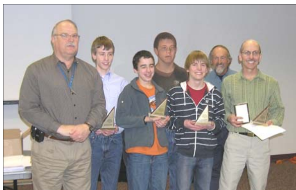
Photo: The Sandpoint Middle School MATHCOUNTS team took first place at regional competition in February. The team is flying to Boise (courtesy of generous PAFE funding) to compete in the state competition in March.